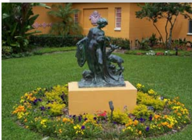
Albin Polasek Museum & Gardens