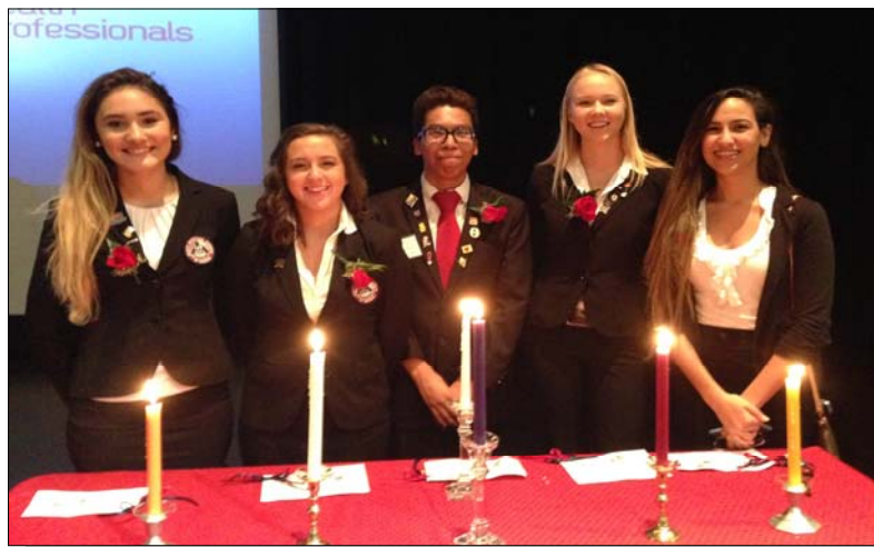
The newly elected Region 9 Officers